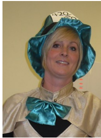
World Book day—a few years ago